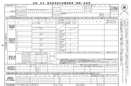
Form (1) looks like this.

You may be given three kinds of application forms; (1) one for dependent exemption, (2) one for one spouse exemption and (3) one for insurance premium exemption. In the form (1), you need to list up all family members who rely on your income, with their MY numbers. The form (2) newly started last year, and requires the details of estimated incomes of you and your spouse. With the (3) form, you can claim a deduction for insurance/pension premium payment, and need to attach certificates of payment which have mailed from your insurance company or the Japan Pension Service.