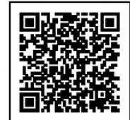
City's coronavirus web page (Japanese)

If you don't have a mask, when you sneeze or cough, do so into a tissue or the crook of your elbow.