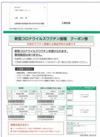
Your coupon looks like this!

Those who have received the coupon can make appointments (for both 1st and 2nd doses) on May 10 (Mon) and after by calling the Call Center (see below) or accessing the city's website ( http://www.city.iruma.saitama.jp/shisei/bousai/1010191/1012463/1012464.html ). You can choose (1) Individual Vaccination at one of designated medical facilities in the city or (2) Group Vaccination at one of special sites in late May and after. See the list of vaccination sites sent with the coupon.